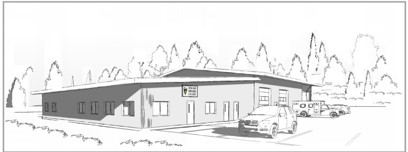
Conceptual Search and Rescue Building